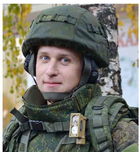
Contract NCO

In the Russian system, if a person wants to lead he should become an officer; if he desires to be a "trigger puller" or perform a vocation, he should become a contract NCO. If a contract soldier desires to be a missile crewman, he will be a missile crewman for his entire career. The Russian system encourages specialization and technical expertise. There does not appear to be any out-of-branch or broadening assignments for enlisted soldiers or officers. Such practices would be contrary to the mission to develop experts at their chosen profession. Although this appears to be a "dead-end" for Westerners, it is not so much for Russians. Russian contract NCOs appear to be content with this system, likely in part due to the Russian military pay system (discussed later), which is well structured for this contract NCO system. The Russian