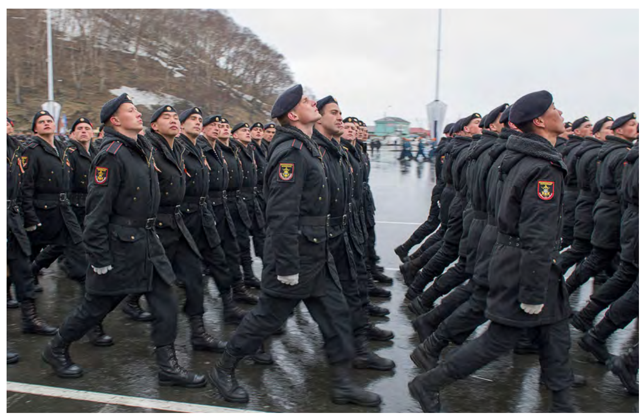
On the March