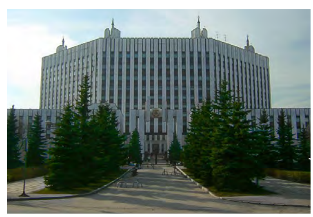
General Staff Academy, Moscow Russia

progression can occur in the Russian Armed Forces is to look at the last three Chiefs of the General Staff, noting the differences in assignments between General Gerasimov (command path) and General Makarov (command path) in contrast to General Baluyevsky (General Staff path). These officers all reached the apex of a Russian military career, by becoming the Chief of the General Staff. Although there are two different ways of achieving this end, neither path is considered better or worse, just different.