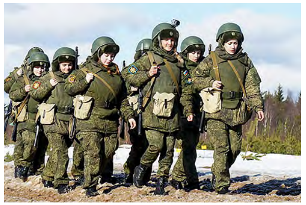
Contract NCOs Conducting Field Training

but this does mean they only serve out of harm's way. Women serve in Russia's militarized intelligence services, and there have been reports of women fighting in various capacities on both sides of the conflict in Eastern Ukraine. Although the U.S. and Russia both utilize women in their Armed Forces, U.S. observers will notice significant systemic differences. It is important to keep in mind that Russian servicewomen serve in the Russian military in the context of a broader Russian culture. It is common for Russian women to wear high-heals and other ornamentation in field uniforms, something that would be