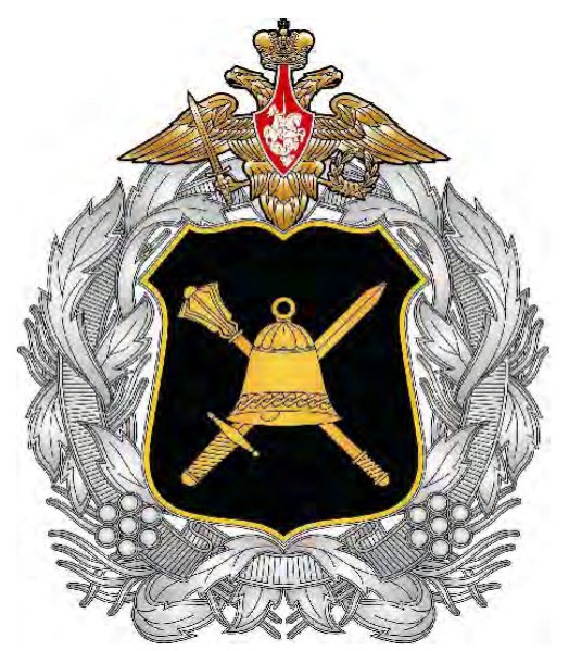
Emblem of the Russian General Staff

One of the most interesting differences between the armies of the post-Soviet Union and the West is the presence of Prussian-style General Staffs. These general staff systems provide far more than just a planning apparatus; they also function as doctrine and capability developers. The U.S. Joint Chiefs of Staff is often equated with the Russian General Staff, but this is a great understatement of the Russian General Staff's importance. The Russian Chief of the General Staff has far more authority than any flag grade officer in the U.S. military. In terms of equivalency, the Russian General Staff has the same responsibilities for longterm planning duties conducted by the U.S. Office of the Secretary of Defense and unified combatant commanders; elements of strategic transportation performed by USTRANSCOM; doctrinal and capabilities development, as well as equipment procurement for all branches of the Ministry of Defense. It even has an