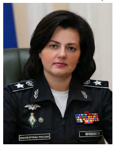
General Tatyana Shevtsova Deputy Defense Minister (Finance)

The Russian Federation has a long tradition of women in uniform.<sup>38</sup> Women served in the Soviet military in many capacities in the Second World War. In addition to agricultural and industrial work, women served in noncombat positions such as uniformed secretaries, translators, nurses, and block wardens. Although rare, the Soviet Union was the only belligerent that utilized women in combat roles. Soviet women served as air defenders, in the infantry, and as snipers. There were also three women's air force regiments including the famous 46th "Taman" Guards Night Bomber Aviation Regiment (known as the "Nachthexen" or night witches by the Germans). In the modern Russian military, women still regularly serve, but not in combat arms roles. As previously mentioned, it is not uncommon to see the wives of contract NCOs and officers enlist as contract NCOs. These spouses often serve as uniformed cooks, admin support, and radio/telephone operators (in garrison). But women may