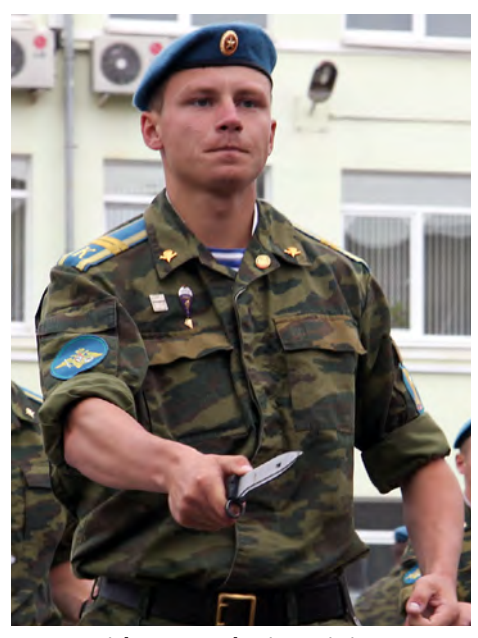
Airborne cadet in training

A system that has a weak or nonexistent NCO corps and relies on a strong officer corps inherently requires a larger number of officers, but, due to this reality and a much