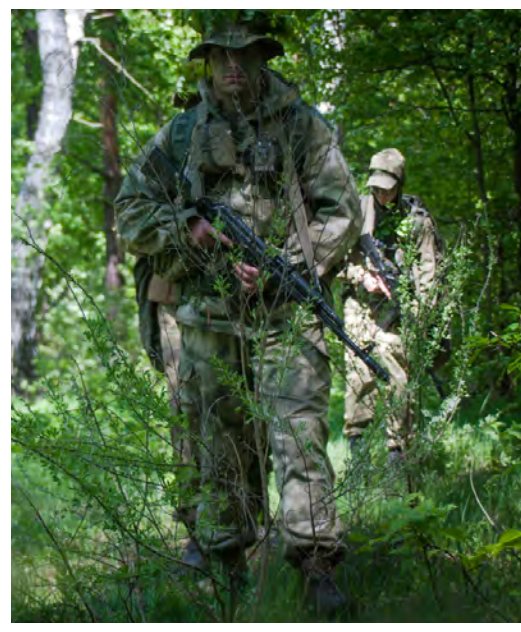
Field Training Image Courtesy: Russian Ministry of Defense

late 2016, the Russian Federation announced Russian officers occupying command positions would wear new badges to signify their positions. The new badge has unofficially been dubbed "wings" on account of its appearance, and is reportedly based on traditions from the Tsarist Army. These new badges are worn by commanders-in-chief of branches of the Armed Forces, commanders of military districts and branches of troops, and commanders of divisions, brigades, regiments, and separate battalions. The new symbols also appear on the uniforms of chiefs of military educational institutions and secondary educational institutions (Suvorov and Nakhimov military schools), that are administered by the military authorities. The new badge consists of the Russian tricolor with centrally placed badges of Armed Forces services (Ground Troops, Aerospace Troops, and Navy) or branches of troops (artillery, railroad, engineering, tank troops, etc.) and symbols of military units, military